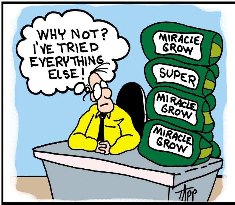
Church growth in the 21st Century.